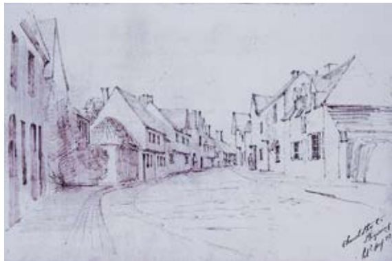
1846 sketch - Church Street