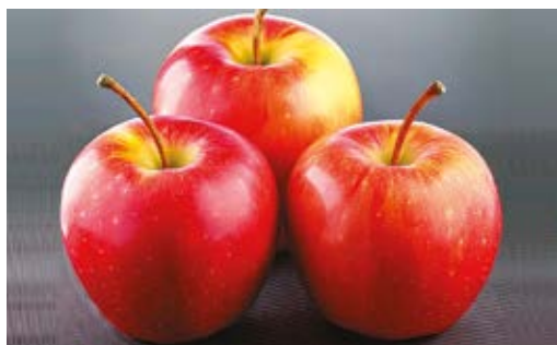
The 'Pink Lady® apple

Perhaps we ought to have a Cripps Pink apple tree in our Community Orchard to recognise this 'Son of Steyning's' legacy to the fruit world?