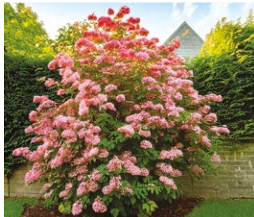
Plant of the Month: Viburnum x Bodnantense "Dawn"